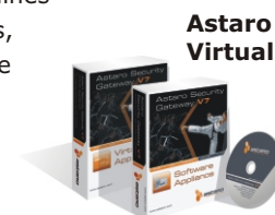
Astaro Software & Virtual Appliances