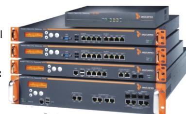
Astaro Hardware Appliances

▶ Astaro Virtual Appliance: Ready-to-go virtual machines for VMware environments, helping you to consolidate your IT infrastructure.